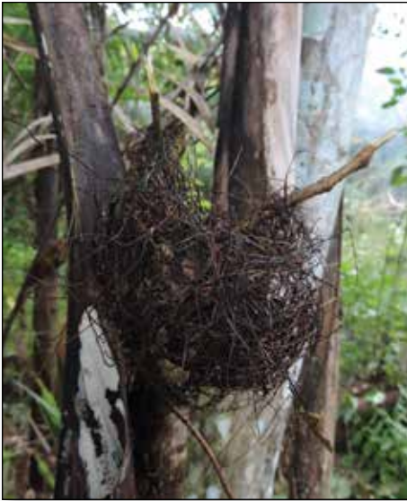
A bird's nest in the tropical rainforest of Brazil made up of Marasmius rhizomorphs .

exploratory structures are used to find new substrates for nutrient exploitation and provide protection from environmental stress, combative antagonistic fungi, insects, toxic substances, and even provide protection from UV light. Species developing rhizomorphs tend to be abundant in their ecosystems; Armillaria in temperate forests, Polyporus -like species and the Horsehair fungi in subtropical and tropical ecosystems. We know a lot about the biology and ecology of Armillaria from decades of studies but little to no information on the rhizomorphic tropical fungi. We are continuing our investigations to learn more about these intriguing fungi and their significance in tropical ecosystems.