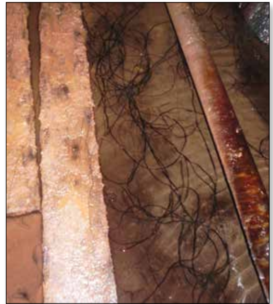
Armillaria sinapina rhizomorphs growing in the Soudan Iron Ore Mine in northern Minnesota. Rhizomorphs grow in the wet mine environment (top photo) colonizing wood timbers (bottom photo) and move from timber to timber throughout the mine.