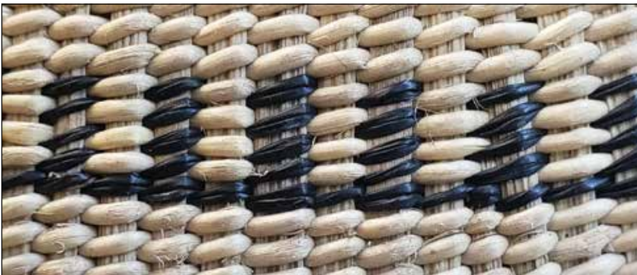
Baskets (top photos) made by Yanomami Indigenous women from the Maturacá community in the tropical rainforest of Brazil using black rhizomorphs in different weaving patterns for decoration. An enlargement photo of a basket (bottom) showing the shiny black rhizomorphs used to weave the basket.