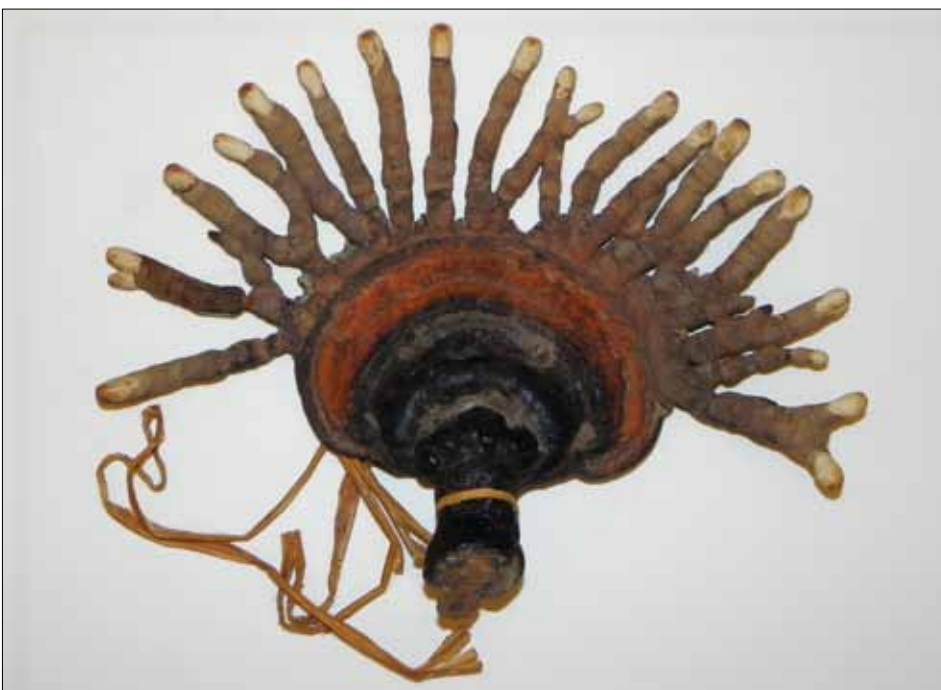
Ganoderma fingers produced as secondary growth from a fully formed fruiting body. The regrowth is an amazing phenomenon for this fungus.

The taxonomy of the various species that make up the Ganoderma lucidum complex is currently being studied and I was very keen to find out what species this West Papua Ganoderma could be. Permission to sample the object for rDNA extraction and sequencing was granted by the Peabody Museum and a small sample of fungal tissue was obtained by the curator from the outer