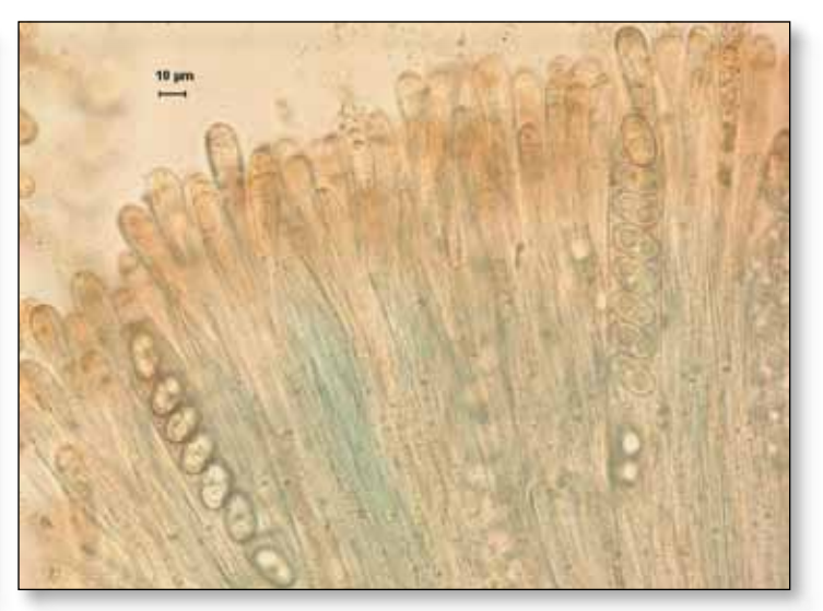
Adelphella babingtonii egg-shaped spores.

One ascomycete was encountered that was not on survey lists and was, in fact, an undescribed stalked cup species in the genus Peziza . Collecting undescribed species poses an ongoing