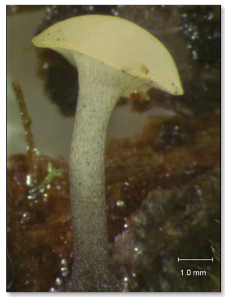
Cudoniella clavus up close.