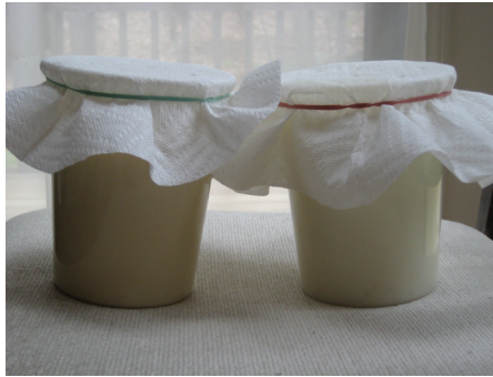
Step 2. Leave covered at room temperature for 24 hours.