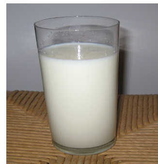
Step 6. Chill for better flavor.