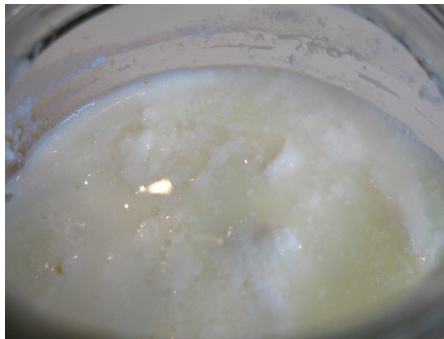
Step 5. Pour kefir beverage into a glass.