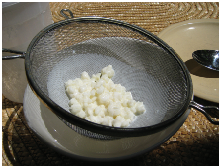
Step 4. Place kefir grains into a container of fresh milk.