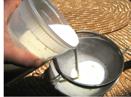
Step 3. Pour through a sieve to retain grains.