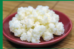
Organically grown goat's milk kefir grains

If you use organic, all-natural products, both inside and outside the body, raise your own food, understand and adore the earth's ability to sustain us—or if you're just embarking on this