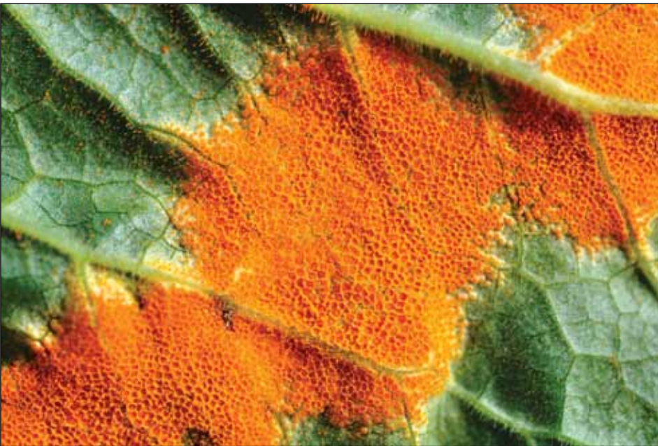
Figure 4. Mayapple rust aecia close-up, courtesy R. Heidt.

about 3,000 to 4,000 species (Cummins and Hiratsuka, 1983). Historically (and for reasons of convenience), most rust species were either placed in Puccinia or Uromyces and scientists agree that these are artificial groupings, as many species aren't that closely related (Aime, 2006). Recently, Andrew Minnis and others determined that this was the case with mayapple rust fungus—it's only distantly related to large groups of species within the genus Puccinia .