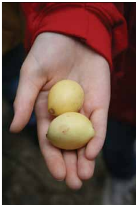
Figure 2. Mayapple fruits, courtesy B. Bunyard.

All eastern morel hunters should be familiar with mayapple, as it blooms just after the morels emerge, and they frequently occur in the same habitat (Fig. 1). The umbrella-shaped plant is an easy one to recognize and it takes its name from, presumably, the fact that the leaf resembles the toes on a foot ( pod = foot; phyllum = leaf). The yellow,