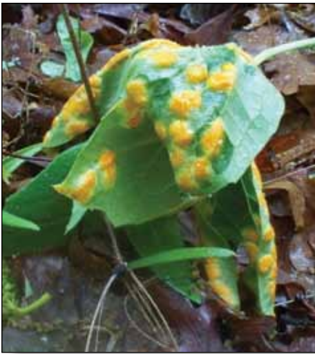
Figure 3. Infected mayapple leaves, courtesy P. Harvey.