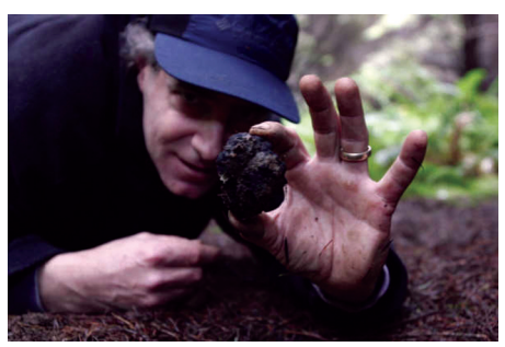
Finding truffles without a dog or a rake.