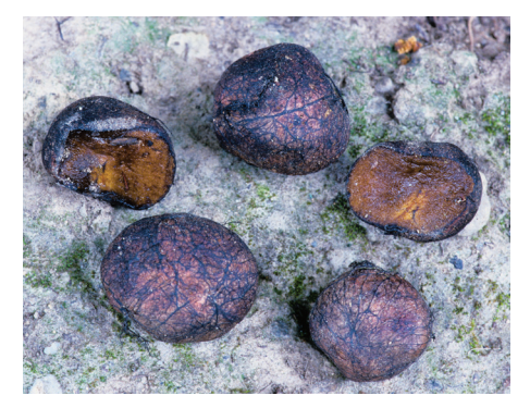
Rhizopogon nigrescens.

[Editor's note: Discussion of the chaga chai will appear in an upcoming issue of FUNGI. For more information about this legendary dinner, including photographs and recipes, visit the FUNGI Web site: www.fungimag.com.]