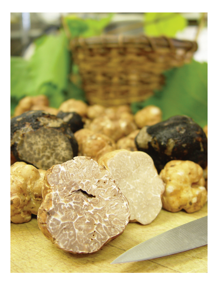
Cut faces of a mature Oregon Spring Truffle, an immature Spring, and a frozen mature Oregon Black Truffle.

Jim had sent a variety of materials to work with and included very specific handling instructions. I had an abundance of fresh