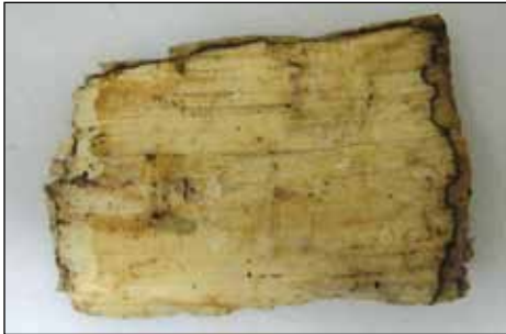
Figure 1 shows a piece of wood which emits light. The light is easily visible in a very dark room after adaptation of the eyes to the darkness for about five

times of superstition, luminescent wood had a great influence on the mind, and many suspected spook and magic when confronted with it in the dark.”]