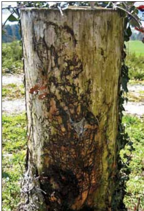
Figure 4. Rhizomorphs on the stump of a pine tree (has exposed luminescent wood) after removal of the bark.

bekennen. Die meisten Menschen gehen nicht gern im finsternen Wald spazieren, und so bleibt es gewöhnlich dem Zufall überlassen, bis endlich jemand auf leuchtendes Holz stösst. Man hat es infolgedessen für eine grosse Seltenheit gehalten, aber zu Unrecht, denn es gelingt ziemlich leicht, sich solches Holz zu verschaffen: Löst man von alten, verwesenden Baumstümpfen z.B. der Kiefer ( Pinus ), der Fichte ( Picea ) oder der Eiche ( Quercus ) die Rinde ab und findet auf dem nackt zutage