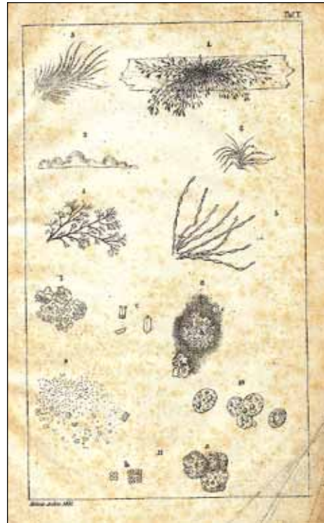
Figure 3. Drawing of wood overgrown with a fungal mycelium (from Heller, 1853). Figure 3. Drawing of wood overgrown with a fungal mycelium (from Heller, 1853).

Years later, Heller addressed again von Derschau’s letter and expanded the report with own observations.